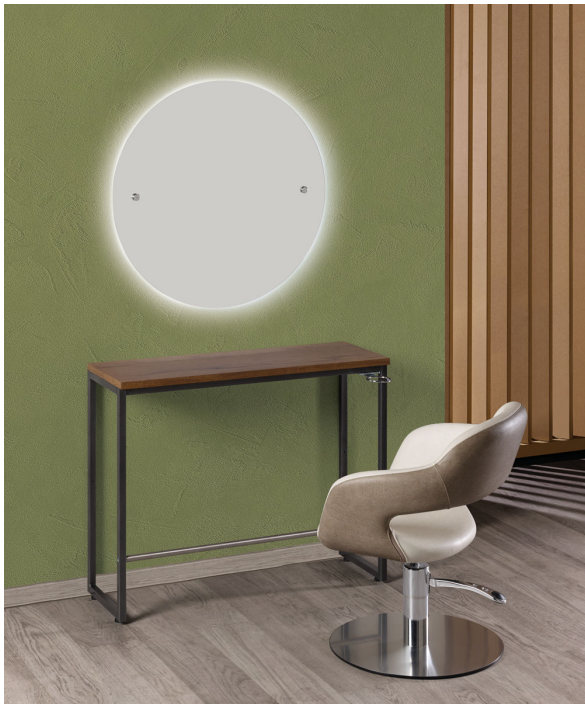
OBERFLÄCHEN IM FOTO: VINTAGE 01

Le immagini sono fornite al solo scopo illustrativo e non costituiscono elemento contrattuale