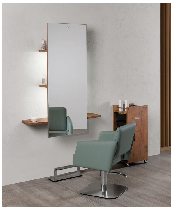
IN PHOTO MATERIAL: VINTAGE 01

Le immagini sono fornite al solo scopo illustrativo e non costituiscono elemento contrattuale