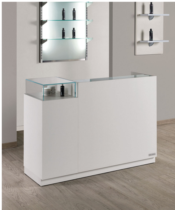
IN PHOTO MATERIAL: WHITE ASH 06

Le immagini sono fornite al solo scopo illustrativo e non costituiscono elemento contrattuale